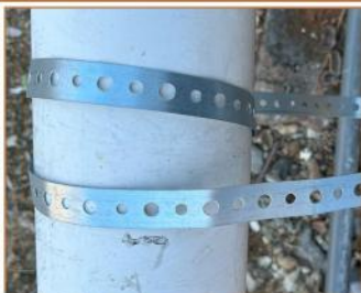
Step2 Wrap the strap around the pipe.