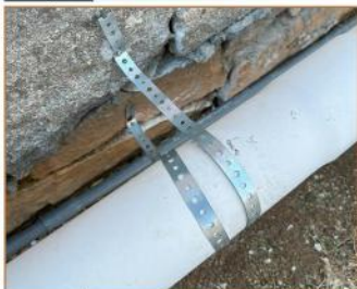
Step4 Installation complete.