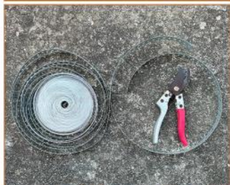
Step1 Cut an appropriate length of the strap.