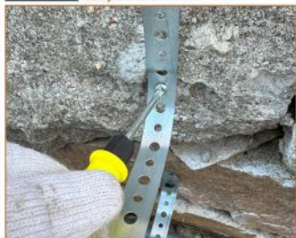
Step3 Drill in screws to secure the pipe.